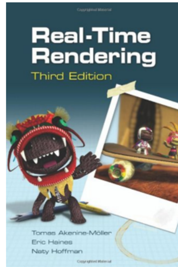
Real-Time Rendering, Third Edition